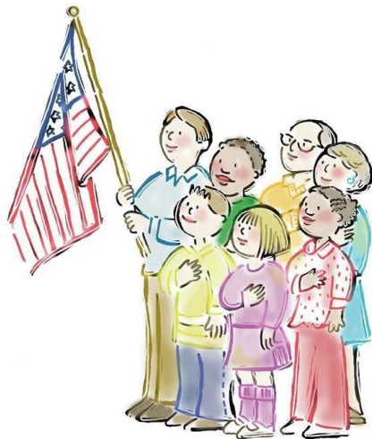
Veteran/Military Friendly Congregation