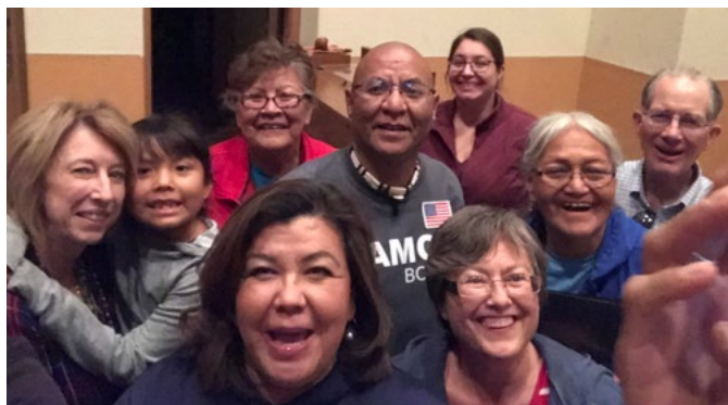
A wonderful group of parishioners at Good Shepherd Mission, Ft. Defiance, AZ

I believe that some of the spirit and energy about which I just mentioned comes from the Episcopal Church allowing the Navajo people to bring into the church's liturgy some of their own traditions and prayers - which is